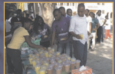
Students and staff enjoying snacks after the float