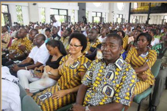
Section of the audience at the thanksgiving service