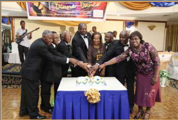
Cutting of the anniversary cake