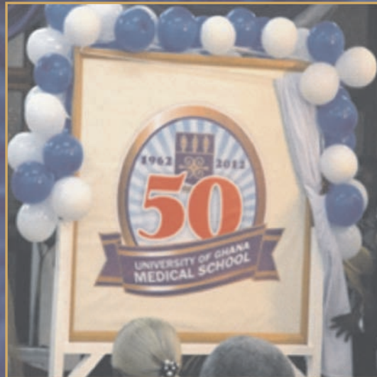
UGMS @ 50 logo