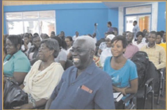
Some Audience during the public lecture