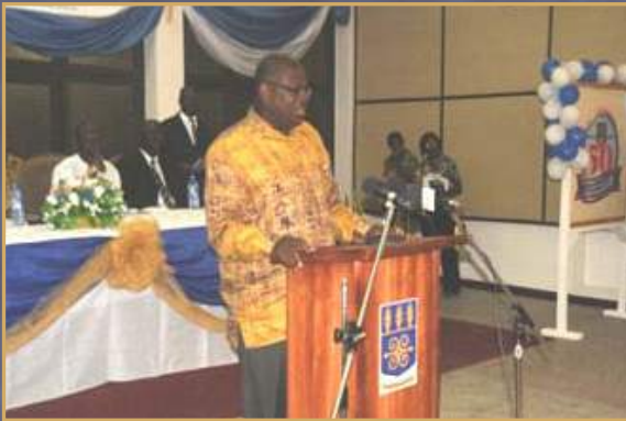
The V C giving a Speech @ the launching