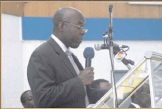
Former provost giving a speech at the public lecture