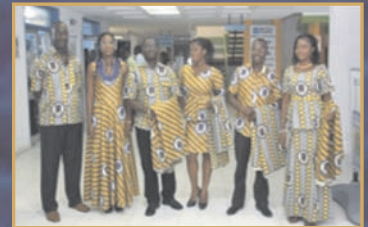
Staff and students modeling the Anniversary cloth