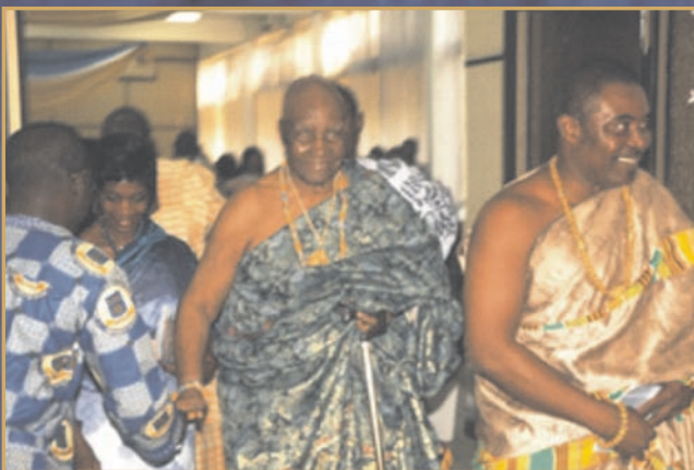
Dignitaries at the Anniversary Celebration