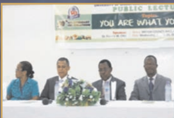
Some Principal Officers of UGMS @ a Public Lecture