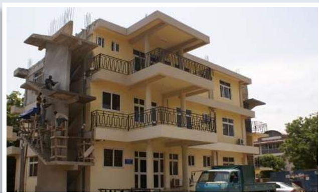
New UGMS Research Building Complex (1 st Floor)

The Committee, which meets monthly, has developed a research policy for the School and is tasked to coordinate all research activities in the School.