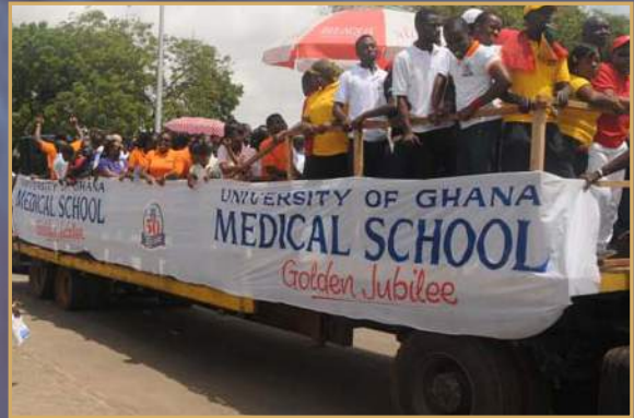
Staff and students during the float