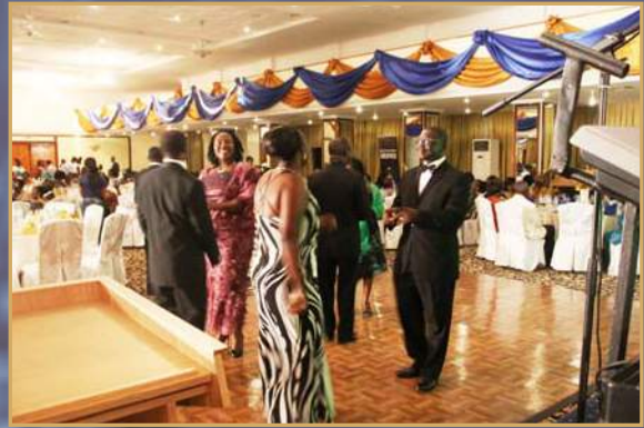
A section of staff on the dance floor