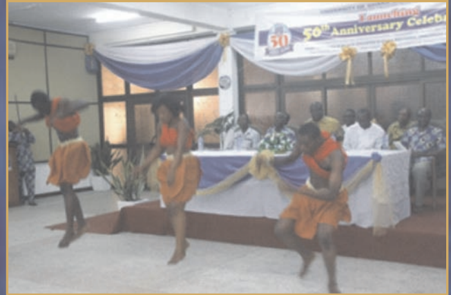
A cultural Performance during the Launching