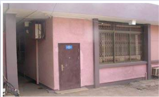
The Old UGMS Research/Alumni Office

At the moment, the office shares the same space with the Alumni office in the Basic Sciences building. A new research office complex is being constructed on the 1 st floor of the Bentsi-Enchill building situated near the Maternity block of the Korle-Bu Teaching Hospital. The office, when completed, will house the General Research Office and that of the Research Coordinator and other offices including Quality Assurance and some major research projects in the School.