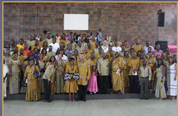
Staff and students after the thanksgiving service