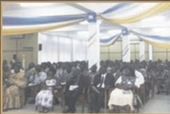
A Section of Staff and Students @ the launching