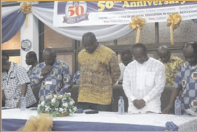
Some Principal Officers of UG @ the launching